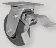
DT Series Dual Pedal Total-Lock Caster