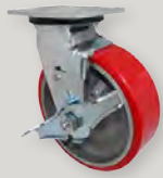
27 Series Swivel Caster Shown With Optional Top Lock Brake and Raceway Seals