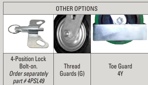
4-Position Lock Bolt-on. Order separately part # 4PSL49 Thread Guards (G) Toe Guard 4Y