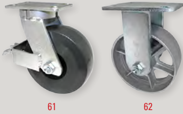
Swivel caster shown with optional face contact brake Part #61hu80li6525fy