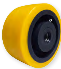
PX (See page 146)