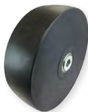
NX (See page 152)