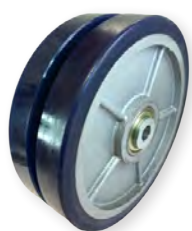
DW (See page 149)