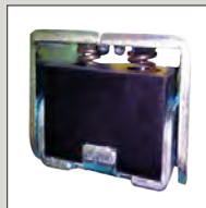
Springs are encapsulated in a polyurethane block for protection