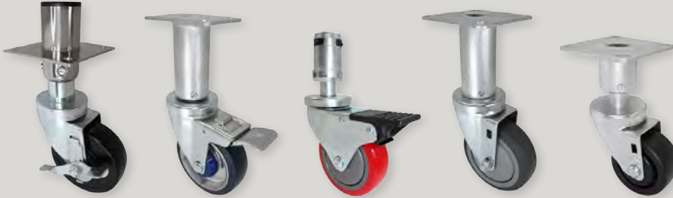
H5 Series Adjustable Leg