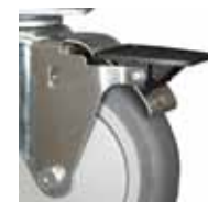
Tech Lock Pedal Brake (H)