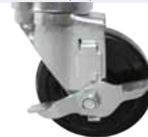
Vertical Top Lock (V)