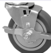
Top Lock Brake (T)