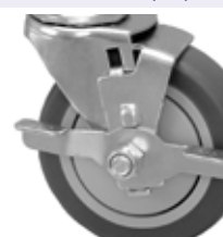
Top Lock Brake (T)