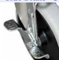
Vertical Top Lock Brake (V)