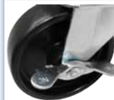
Side Brake = S