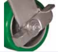
Cam-Lock Brake (C)