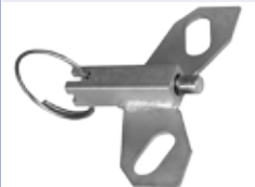
4-Position Lock Bolt-on. Order Separately Part# 4PSL27