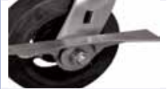
A-Cam Brake (A)