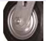
Thread Guards (G)