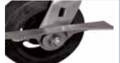
A-Cam Brake (A)