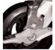
Top Lock Brake (T)