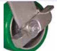
Cam-Lock Brake (C)