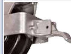
Face Contact Brake (F)