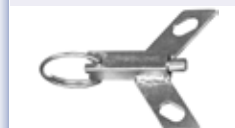
4-Position Lock Bolt-on. Order Separately Part# 4PSL57