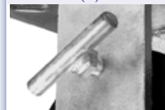
T Handle Brake (R)