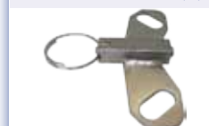
4-Position Lock Bolt-on. Order Separately Part# 4PSL61