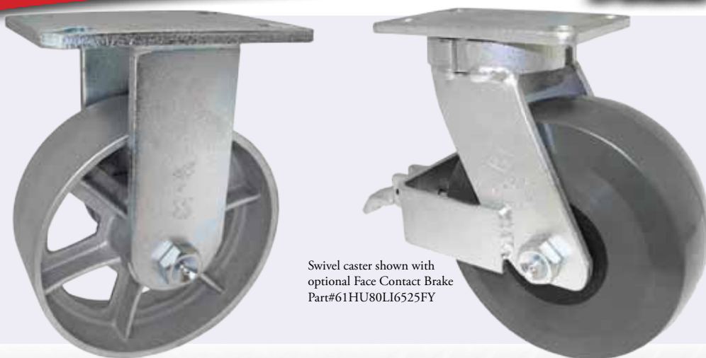
Swivel caster shown with optional Face Contact Brake Part#61HU80LI6525FY

Durable Superior Casters® Kingpinless Casters are designed for unsurpassed durability and use in abusive and demanding shock load applications that may cause traditional kingpin casters to fail. Our 61 Series casters are made out of ASTM1045 steel, drop forged 5/16" thick top plate integrates with a forged 3" diameter precisely machined raceway with a single row of hardened 1/2" ball bearings. The legs are formed from 3/8" steel, double welded to the outer raceway for maximum strength. Our unique offset raceway design, heat treatment and tempering processes allows our casters to carry the maximum weight of the bearings used, without horizontal wear, kingpin failure or fracturing of welds; these advantages enable our kingpinless casters to handle side thrust force better than our competitors designs. There are over a dozen wheels, bearings, brakes and options to choose from.