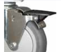
Tech Lock Pedal Brake (H)