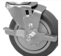
Top Lock Brake (T)