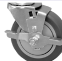
Top Lock Brake (T)