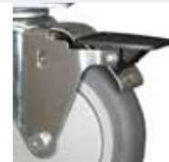
Tech Lock Pedal Brake (H)