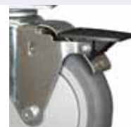
Tech Lock Pedal Brake (H)