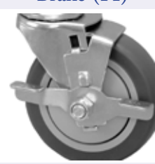
Top Lock Brake (T)