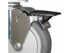
Tech Lock Pedal Brake (H)