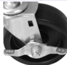
Cam Brake =C