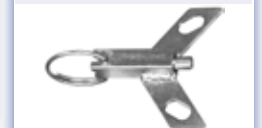
4-Position Lock Bolt-on. Order Separately Part# 4PSL57

Dual wheel casters offer higher weight capacities with minimal overall heights, better load distribution, floor protection and increased mobility than single wheel casters by spreading the weight over a wider floor area while offering wheel differential action, resulting in less friction between the wheels and the floor, requiring less effort for the caster to swivel. Our D1 Series casters are made out of ASTM1045 steel, drop forged 5/16" thick top plate integrates with a forged 3" diameter precisely machined raceway with a single row of hardened 1/2" ball bearings. The legs are formed from 3/8" steel, double welded to the outer raceway for maximum strength. Our unique offset raceway design, heat treatment and tempering processes allows our casters to carry the maximum weight of the bearings used, without horizontal wear, kingpin failure or fracturing of welds; these advantages enable our kingpinless casters to handle side thrust force better than our competitors designs.