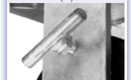
T Handle Brake 1 Side =(R) 2 Sides =(W)