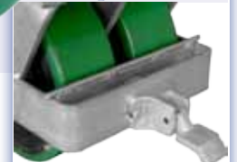
Face Contact Brake (F)